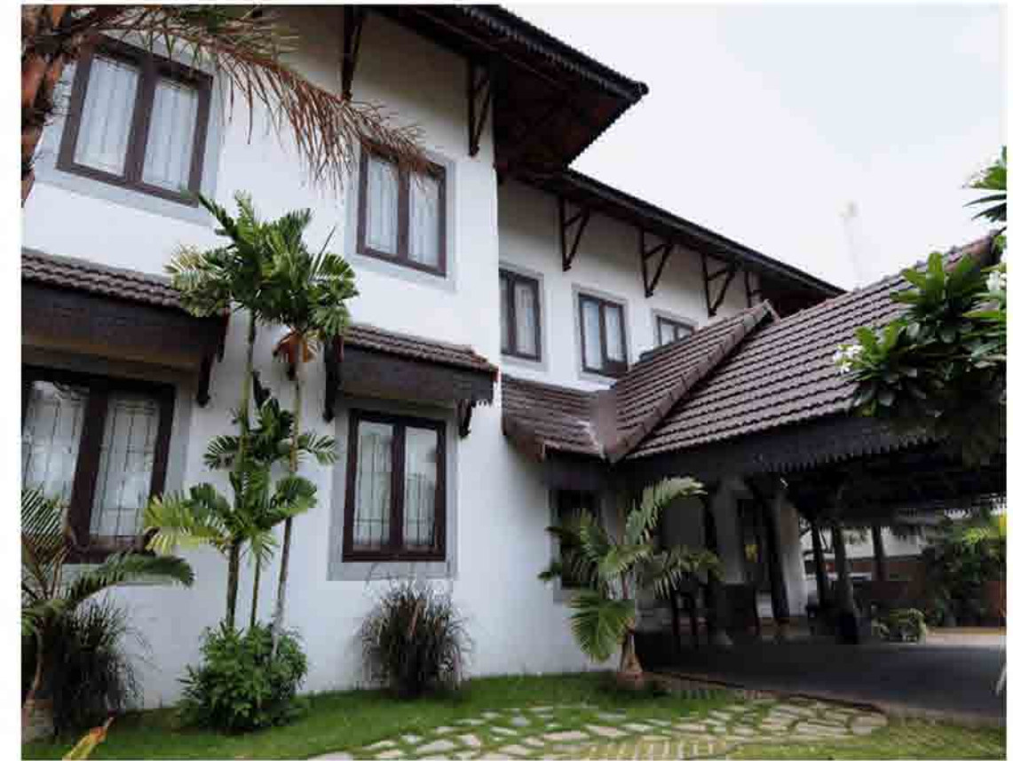
HEMA VIJAY SUNPROOF Series of tiled roofs keep out the worst of the heat