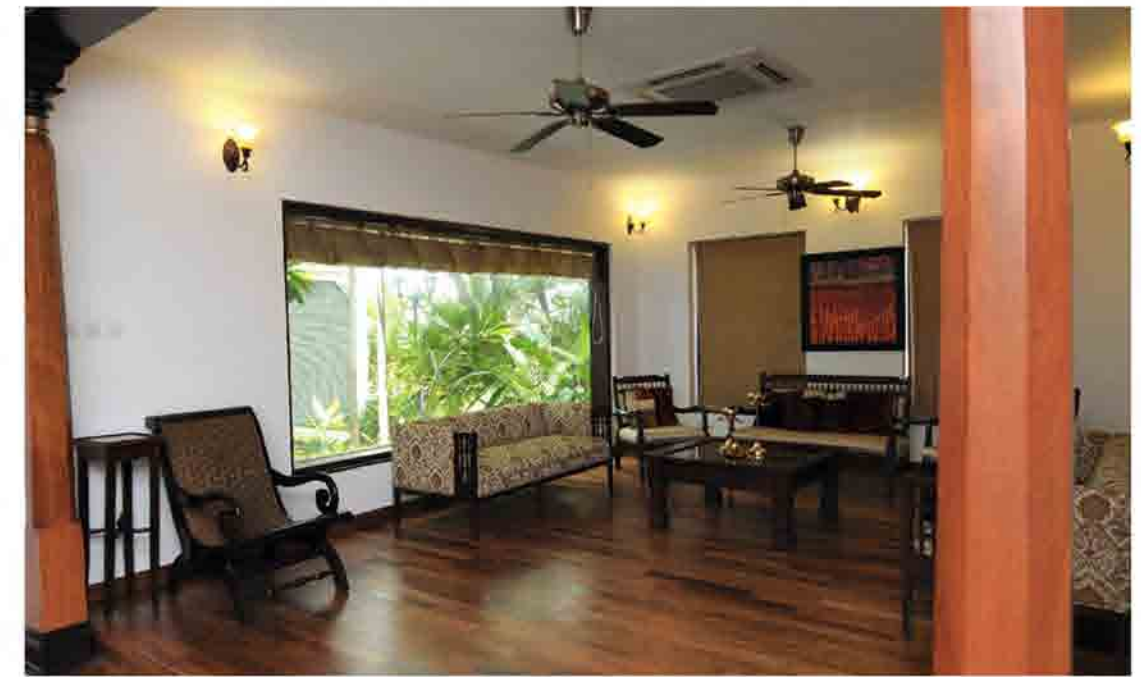
LIGHT & AIRY Large spaces breathing with wood and windows

Beautiful hard wood and vividly coloured Athangudi tiles floor a good part of the house, while unpolished granite paves the car park and natural laterite stones dominate the garden area. Within the house, restored antique furniture and salvaged wooden pillars add to the traditional ambience. The other plus points include strategic skylights that channel natural light into the house, while split floor levels add variation to the inner spaces.