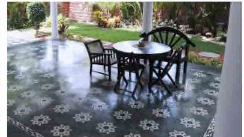
TILE TALE The Athangudi appeal never fades