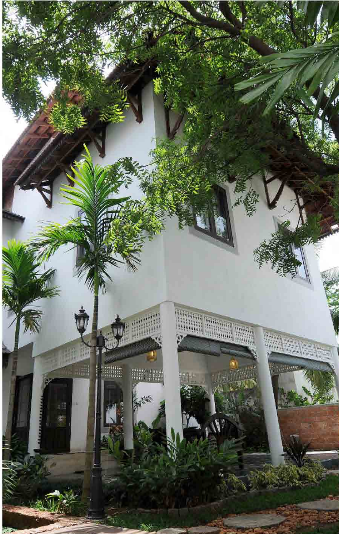
GRACEFUL Traditional lines, new home

'An airy, bright, friendly and easy-to-maintain traditional Kerala-type house with lots of natural material' was the basic agenda set for this house. So, the house was given a central open courtyard, but closed off from the built space because of issues of mosquitoes, rain and security concerns.