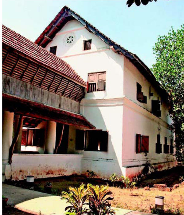
A library stacking literature on the Jews of Kerala will be readied at the Paravur Jewish synagogue which is a part of the Muziris Heritage Project.